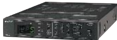
TU-1041U Tuner unit